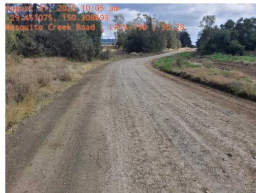
SR13 Mosquito Creek Road

Contractors ATJ's Earthworks have completed 2.7km of formation grading and 900m of damage repairs on SR103 Ravenscraig Road. They continue to work on SR44 Boundary Creek Road, resheeting a 2.6km section of damaged pavement.