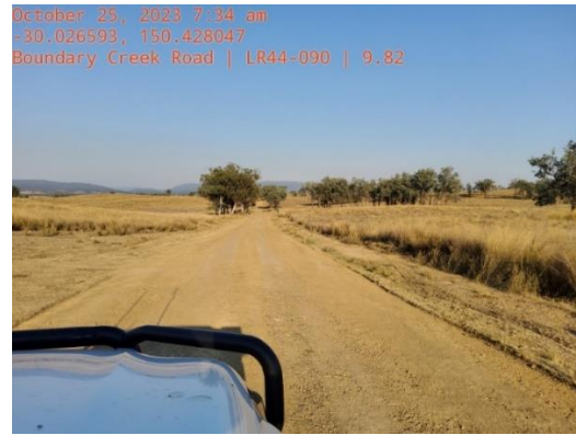
SR44 Boundary Creek Road

Council continues to value add to contracted flood damage restoration works wherever possible, by extending works using existing, Council funded maintenance budgets.