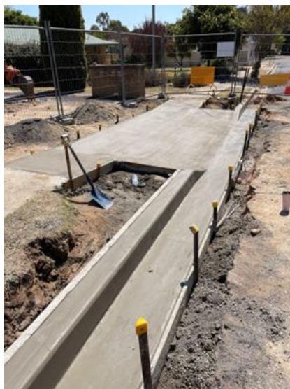
Plunkett Street, Warialda

Staff assisted RFS with fires on Pallal, Killarney Gap, Sheep Station Creek and Baroma Roads in October.