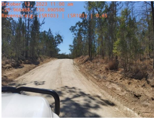
SR103 Ravenscraig Road