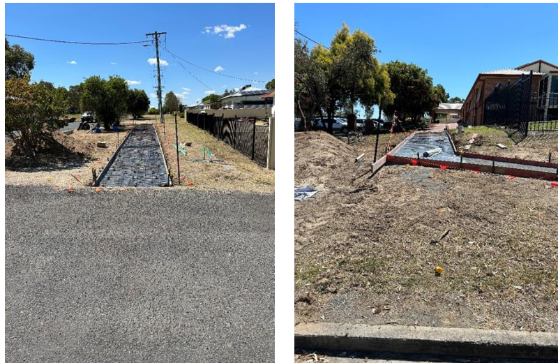
Naroo footpath under construction in Warialda