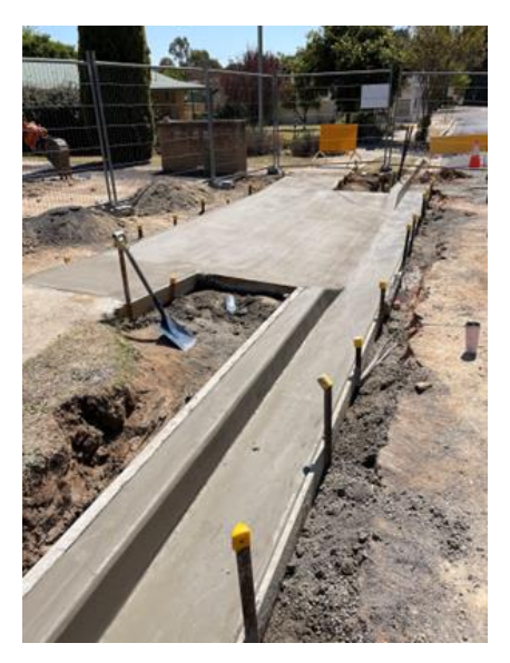
Plunkett Street, Warialda

Staff assisted RFS with fires on Pallal, Killarney Gap, Sheep Station Creek and Baroma Roads in October.