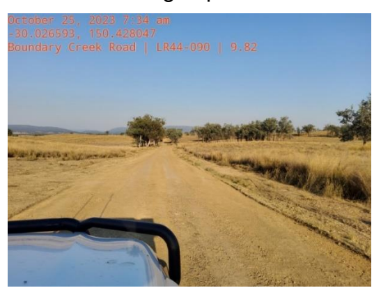
SR44 Boundary Creek Road

Council continues to value add to contracted flood damage restoration works wherever possible, by extending works using existing, Council funded maintenance budgets.