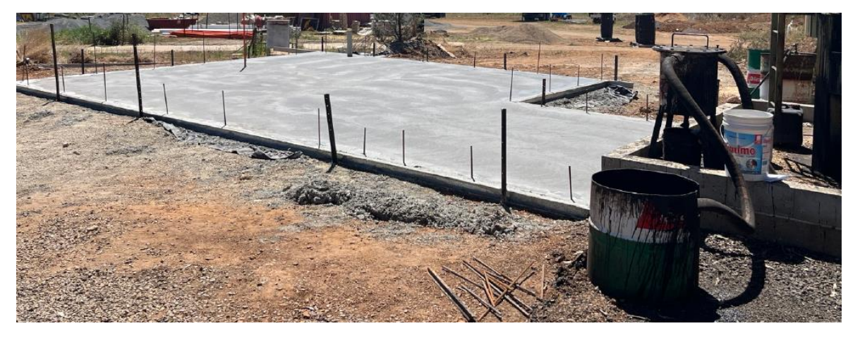
Slab for New Emulsion Tank at Bingara Sewerage Treatment Plant

overflows and spillage. The tank is provided under contract from Downer EDI which locks council into a competitive five-year contract for the supply of emulsion the at Bingara and Warialda depots.