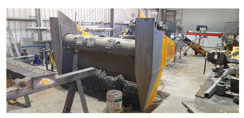
P1663 - Rebuilding Rock Crusher