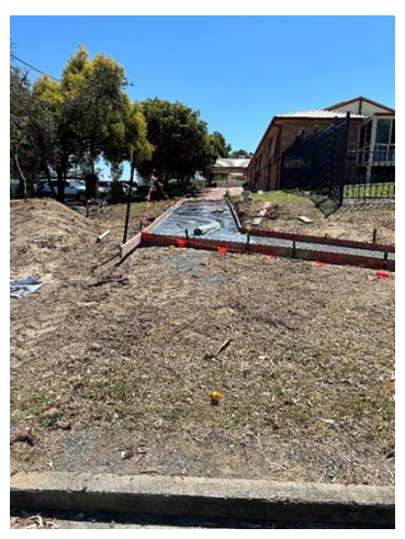
Naroo footpath under construction in Warialda