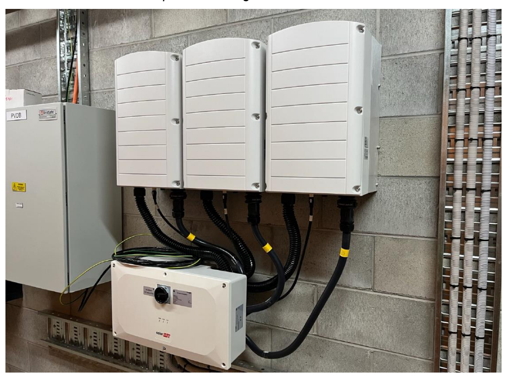
Solar system at Bingara Water Treatment Plant