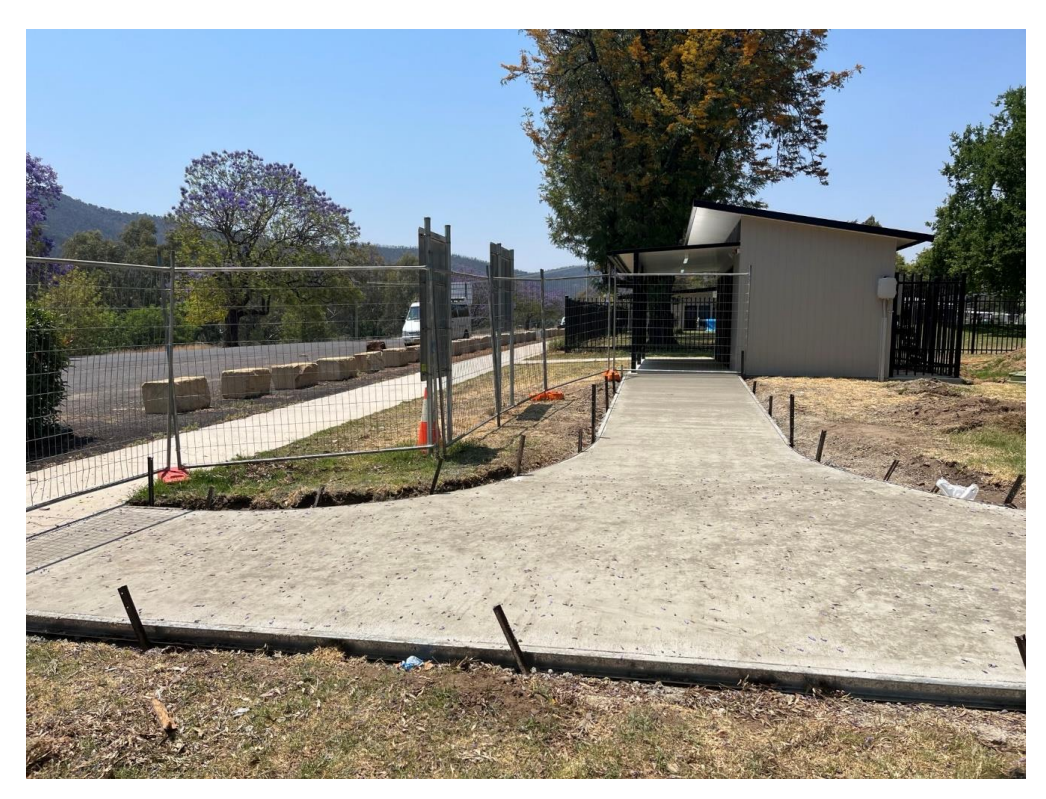
Cunningham Park Earthworks