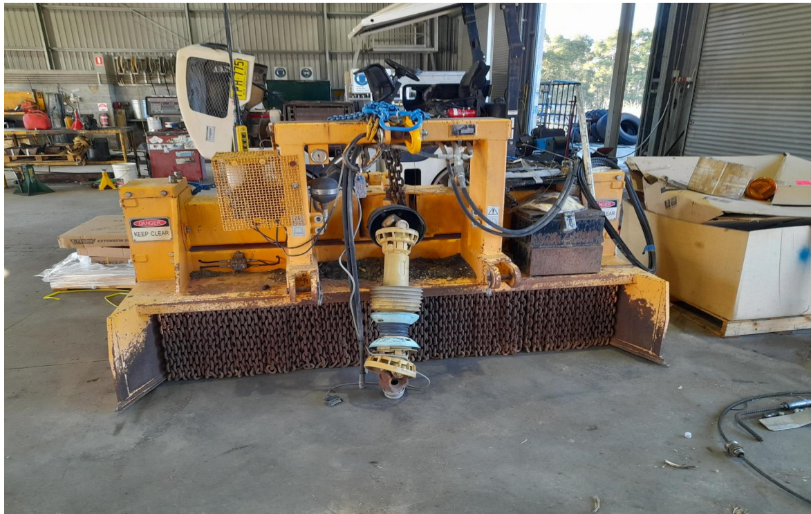
P2079 - Second-hand rock crusher