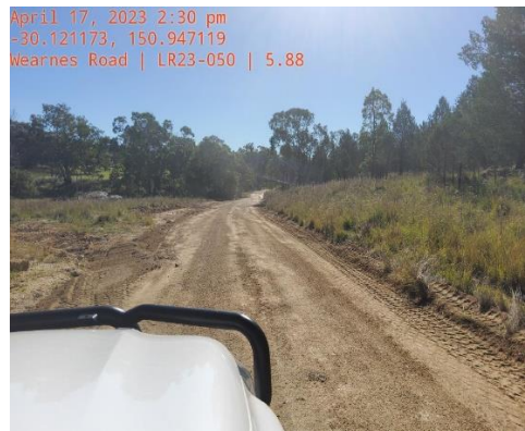
SR23 Wearnes Road

Council contractors, Rollers Australia have completed formation grading on a 10km section on SR23 Wearnes Road.