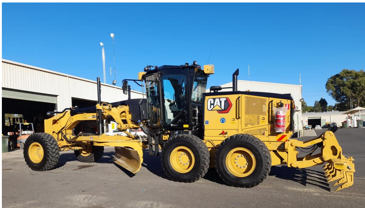
Hired Caterpillar 150 Grader

Major Repairs and maintenance undertaken in the workshops during May included: