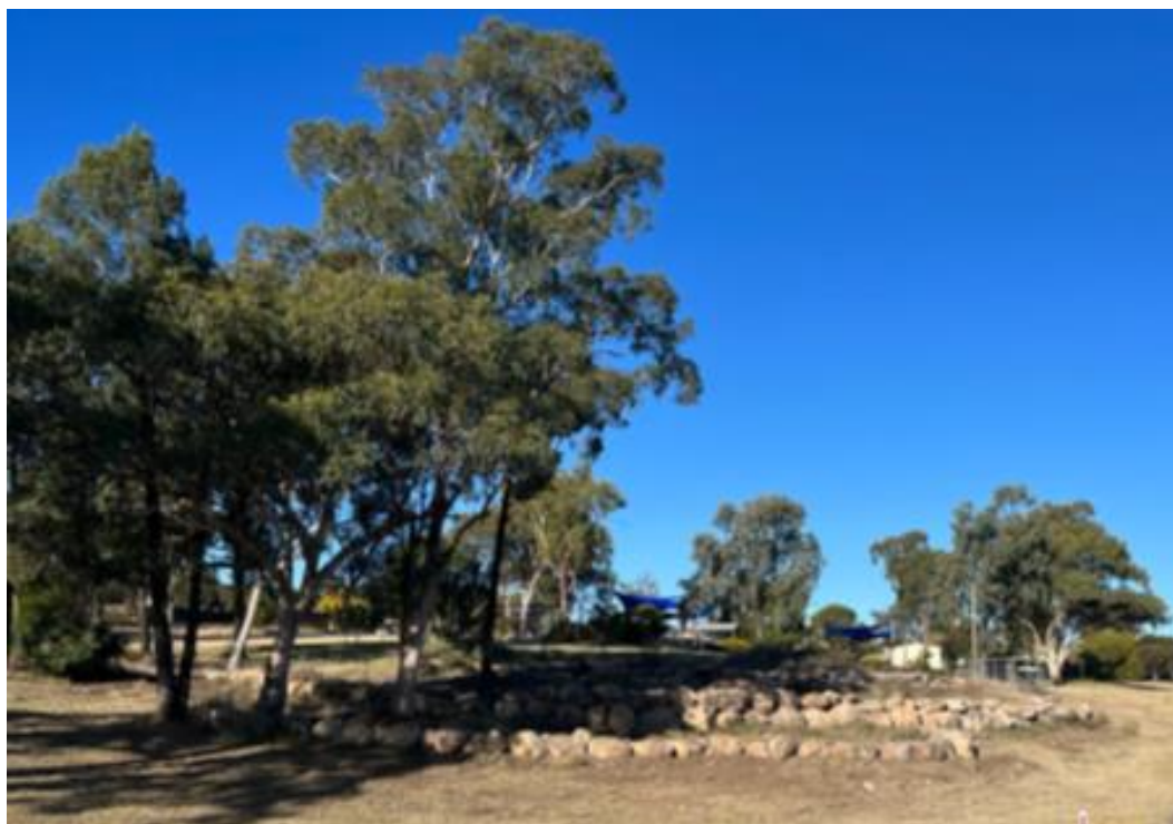
New retaining walls at All Abilities Park, Warialda

The retaining wall has been constructed at All Abilities Park in Warialda. This project was delayed due to contractor availability issues.