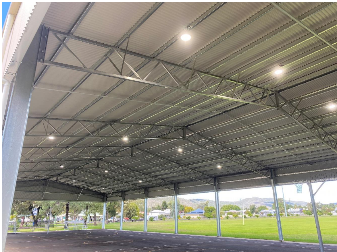
LED Lighting Gwydir Oval netball court

The covered netball court shed was completed in December. Line marking of the court was completed in February. Concrete works at the rear of the amenities and linking the existing footpath have been completed allowing easier access to the netball courts. The aluminum seating has been installed and can also be used for spectators at Gwydir Oval. Led lighting has been installed. The opening of the court will be held during June. The facility is a great asset for the community and can be utilised for multiple functions in addition to netball.