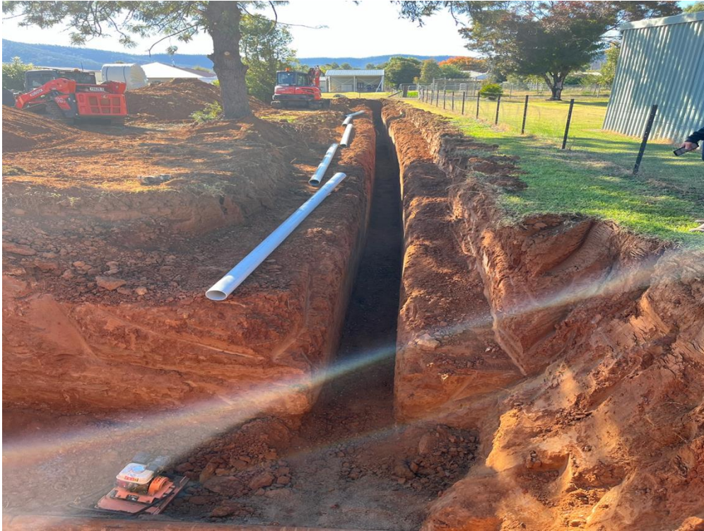
New sewer connection, Keera Lane