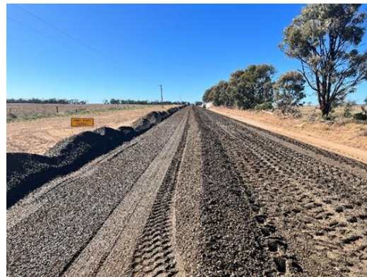
SR9 IB Bore Road