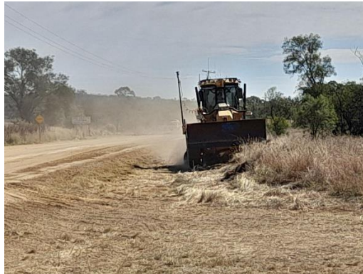
RR7705 North Star Road

The North Star Road Rehabilitation project which involves rehabilitation of 1.2km of existing road and is funded via Transport for NSW's Regional Road Repair Program, is well underway with the 1.2km stabilised and carting commenced. This project is on track to be completed prior to 30 June 2023.