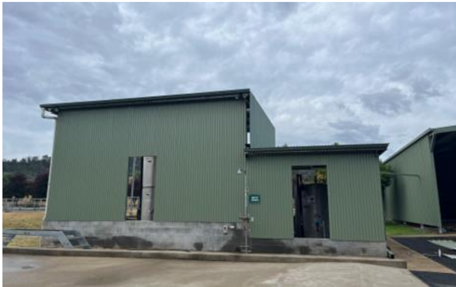
New northern wall at Bingara WTP