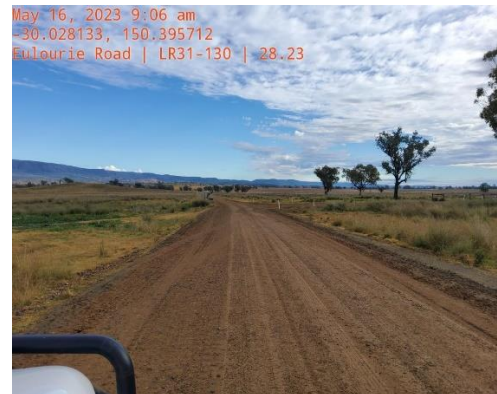
SR31 Eulourie Road

Council contractors, Rollers Australia have completed formation grading on a 10km section on SR23 Wearnes Road.