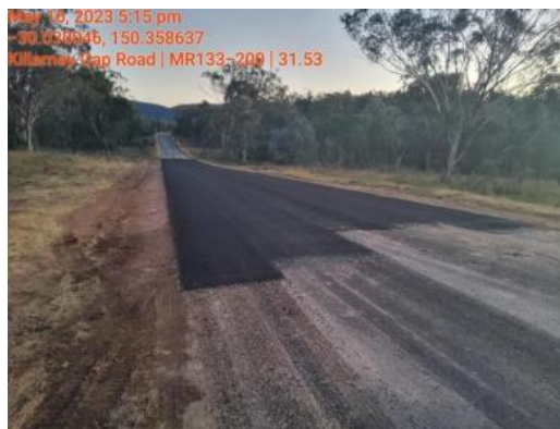
Heavy Patching, Killarney Gap Road