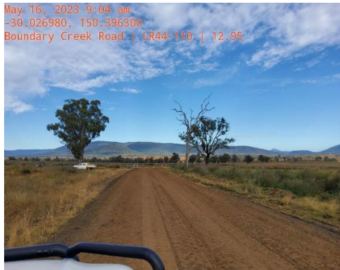
SR45 Boundary Creek Road

Throughout May, Flood damage crews completed a 37.5km of resheeting and formation grading on SR31 Eulourie Road and 17.1km of resheeting and formation grading on SR20 Gravesend Road and have since commenced repairing 4.2km of damaged pavement on SR45 Boundary Creek Road. A second crew are currently working on formation grading on SR41 County Boundary Road.