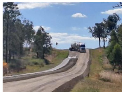
SR11 Horton Road