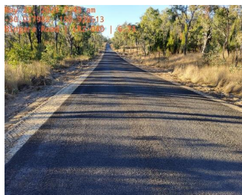
SR2 Bingara Road

Contractors New Pave have been engaged to undertake heavy patching on Council's sealed roads. They are currently working on SR1 Copeton Dam Road and SR2 Bingara Road.