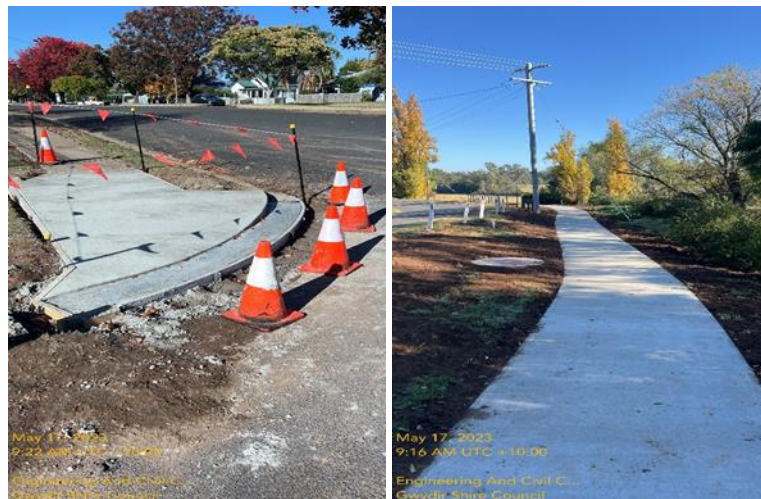
Concrete footpath in Keera and Junction Streets, Bingara

Footpath works on Junction Street and in Junction Park have been completed this month with concrete works now being undertaken on Link Street in Bingara. The team will continue with footpath works now until the end of the financial year, finalising works in Link Street and Cunningham Street in Bingara and starting works in Reedy Creek, Long Street, All Abilities Park and Naroo in Warialda. All projects combined will see over 2,100m of new concrete footpath and nine new concrete pram ramps.