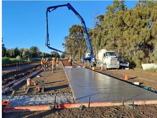
SR41 County Boundary Road, Floodway 3 at Gil Gil Creek

Council contractors, Fin Valley Civil have made good progress with concrete work on the first 4 causeway structures complete including the box culvert structure at Gil Gil Creek. Works are now under way on the final 2 causeways. Works are expected to take until December 2023.