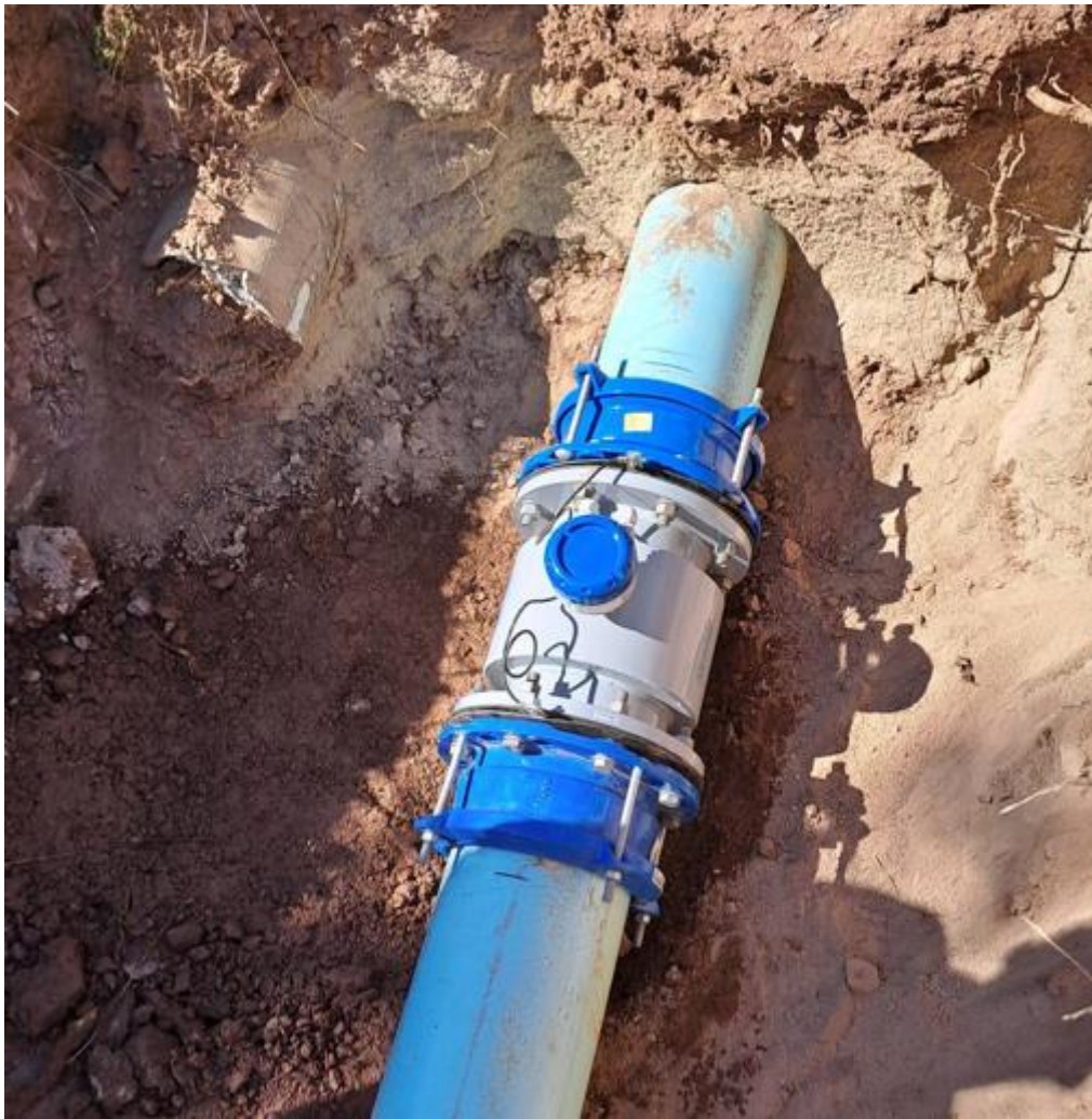
Bingara Reservoir outlet meter

All these meters have been installed in May, electrical and telemetry connection is currently being undertaken. The meters will enable tracking of water losses in the system when comparisons are made with the meters at the water sources.