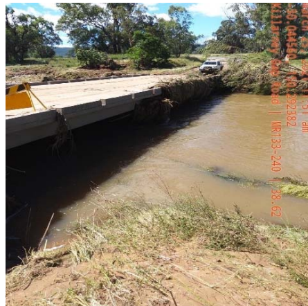
Damages to the Rocky Creek bridge on MR133 Killarney Gap Road