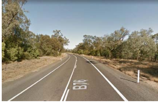
The section of 'The Gardens' that will receive shoulder widening, guardrail and improved signage.