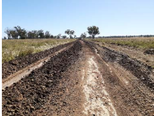
Resheeting works on SR31 Eulourie Road

Resheeting on a section of SR31 Eulourie Road from 1.59km to 3.00km north of MR133 Killarney Gap Road has commenced this month. These works were originally scheduled to be 5km in length, however gravel pit accessibility following flooding has severely limited gravel availability. The full scope of works will be completed as pit access improves following dry weather.