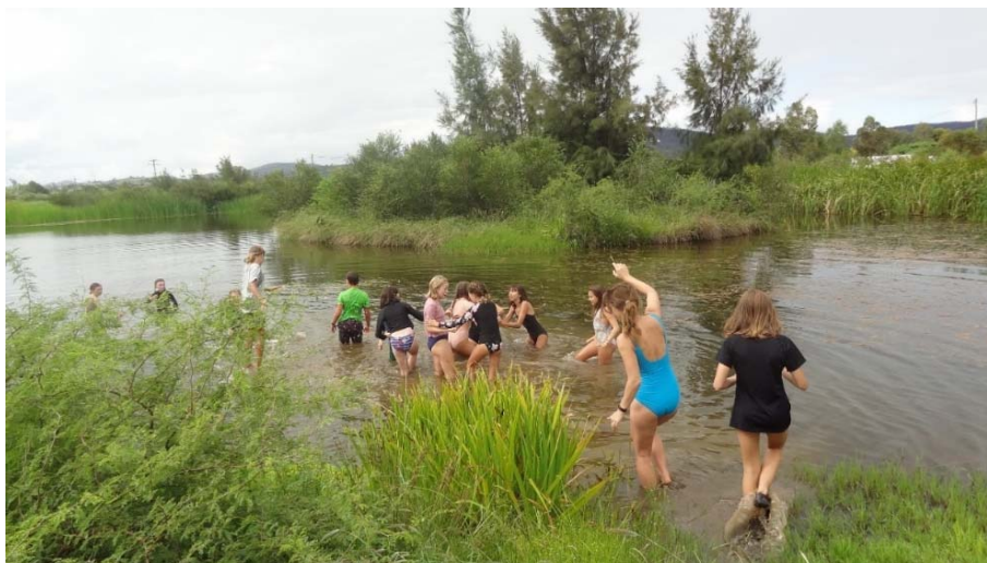
CB Steiner School students cool off with a swim at TLC's Great Lake.

This is page number 8 of the minutes of the Community Services and Planning Committee held on Thursday 14 May 2020