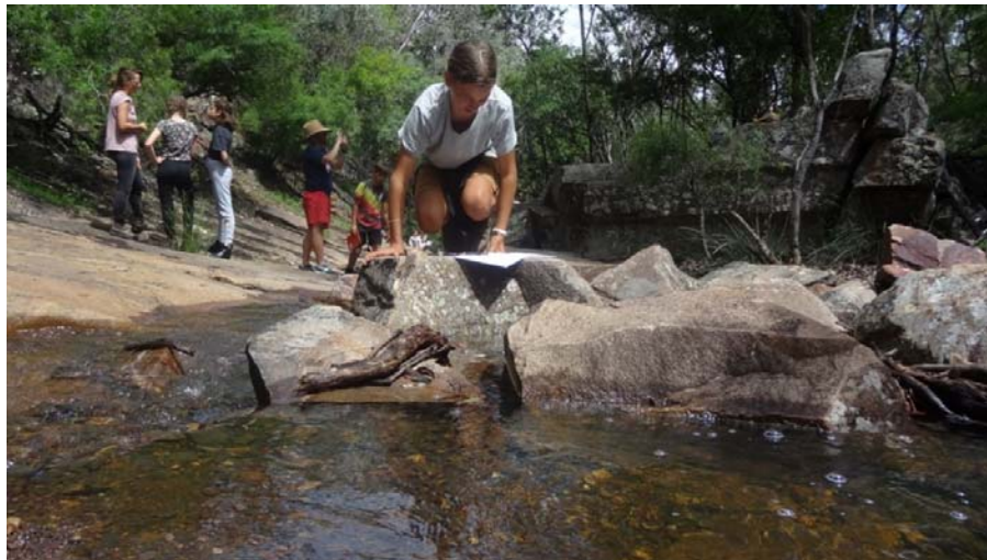
Cape Byron Steiner School Year 7 students sketch and draw at Sawn Rocks.