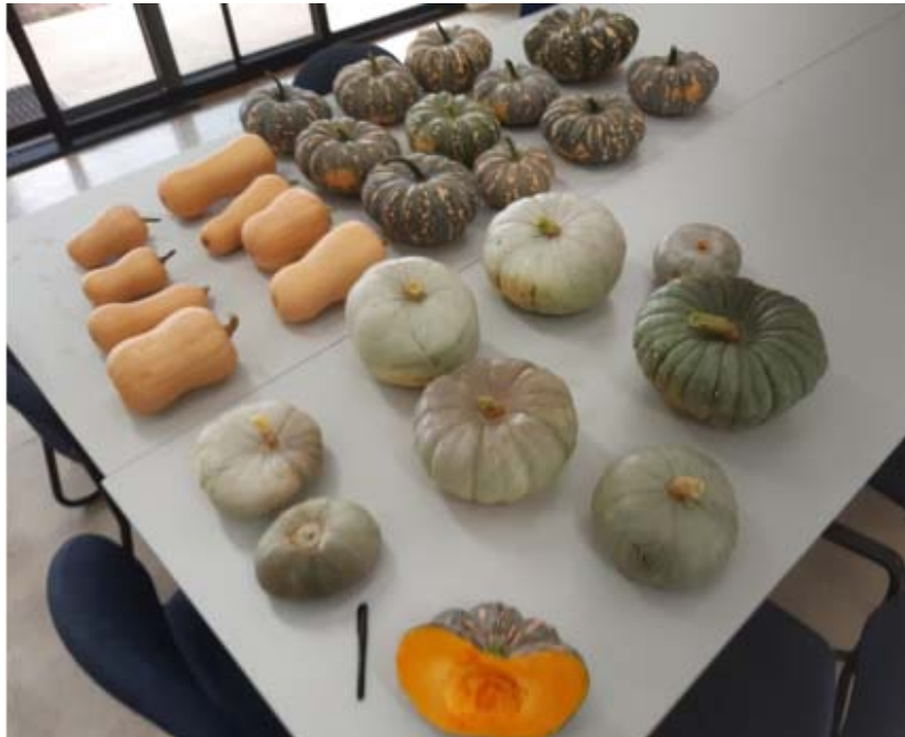
Some of the pumpkin harvest at TLC include Jap, Butternut, Jarrahdale and Queensland Blue pumpkins

There is ongoing seasonal opportunity for this production to take place at TLC, much of it as a by-product of school excursions where students are invited to leave a legacy at the site by planting seeds or seedlings.