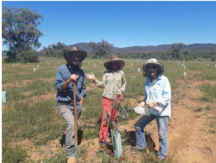
Gwydir Ark members planting koala food trees at TLC.