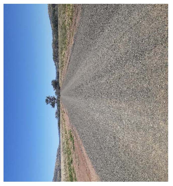
SR17 Back Creek Road gravel resheeting

Work has been completed on a 2.5km section of Back Creek Rd between the properties 'Glenidle' and 'Llangoland'.