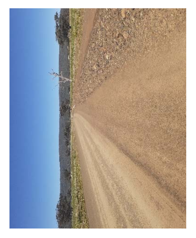
SR16 Trevallyn Rd 'Billandry' gravel resheeting

Work has commenced on a 1.5km section of Trevallyn Rd , west of Bereen Rd over the Horton River. Another 2.8km section of Trevallyn Rd is to be resheeted west of the property 'Billandry'.