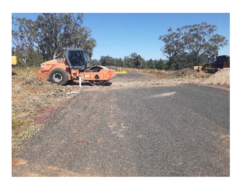
SR003 Elcombe Rd cattle grid removal