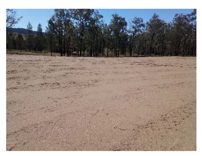
Sheep Station Creek site