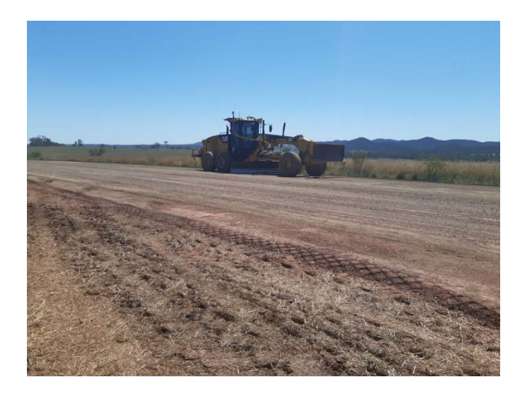
MR63 Fossickers Way 'Beaufort' construction