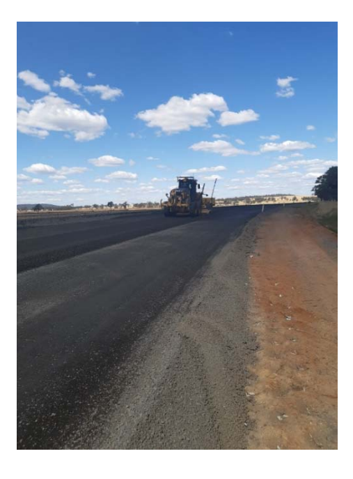
RR7705 North Star Road 'Flaggy' construction