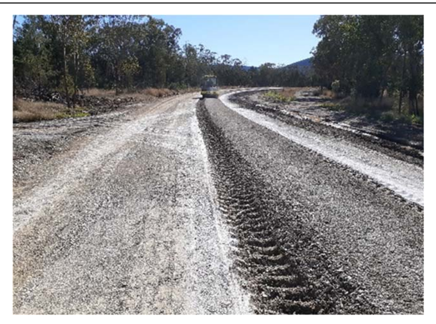
The upgraded pavement being stabilised on SR11 Horton Road.