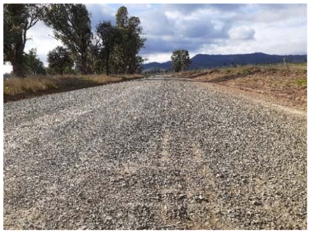
Gravel resheeting SR11 Horton Road flood damage.