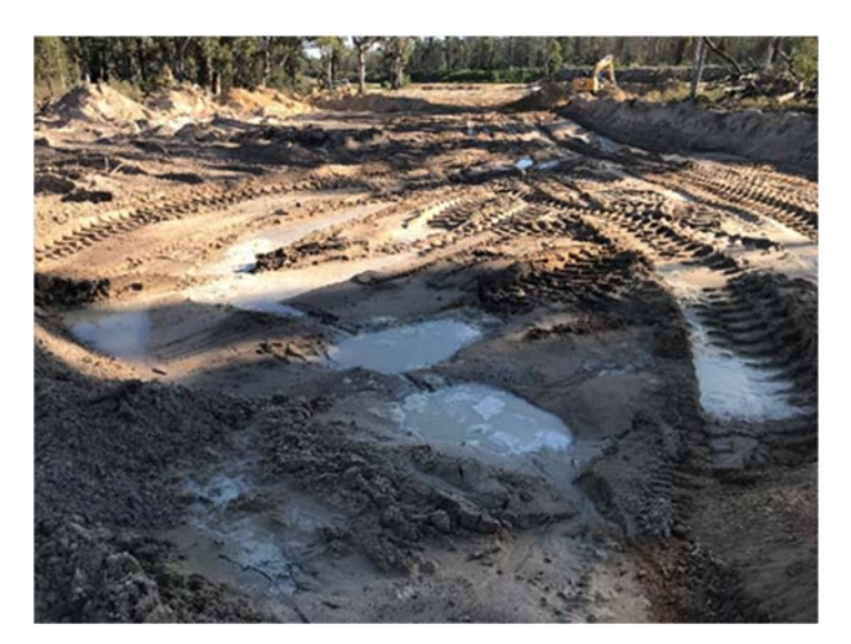
Unsuitable sand material being removed from the HPV Route.

<u>South:</u> This month has seen the maintenance crew undertaking roadside vegetation spraying on SR15 Gulf Creek Road, MR132 McIntyre Road, SR11 Horton Road and MR133 Killarney Gap Road. Staff have also continued with works desilting drains and clearing culverts throughout the network. These works have taken place this month on SR66 Reserve Creek Road and SR207 Yammacoona Estate Road.