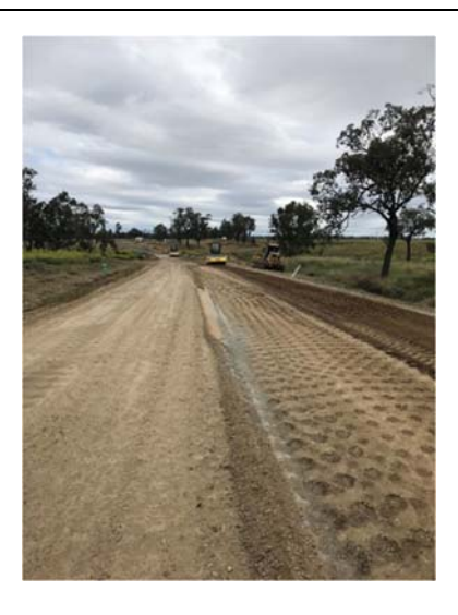
Stabilising the sub-base of the 1.3km section of RR7705 North Star Road.

<u>South:</u> Pavement upgrade works continue on SR11 Horton Road, with the first 3km section, starting from MR133 Killarney Gap Road now stabilised and sealed. The 200mm base layer of gravel has been stabilised, trimmed and compacted to an 8m formation and finished with a 7m graded S5R bitumen Otta seal. An Otta seal uses a range of aggregate sizes to provide a tighter bitumen seal with self-healing properties suitable for low traffic roads. The construction crew have now started carting and forming up the next 3km section, where the same procedure will be undertaken.