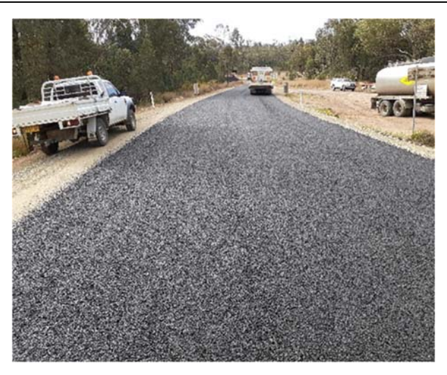
The final sealed pavement on SR11 Horton Road.