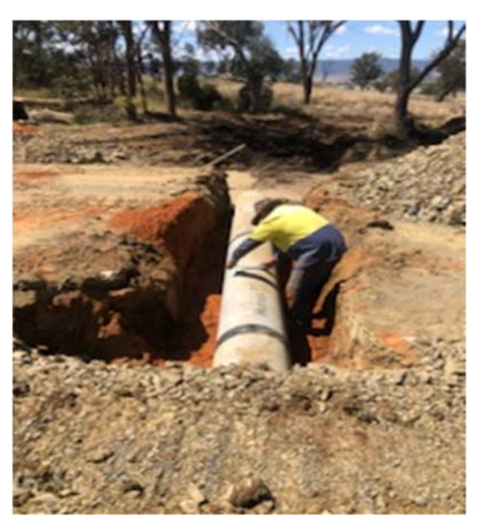
New 450mm pipe being installed ahead of construction crew on SR11 Horton Road.