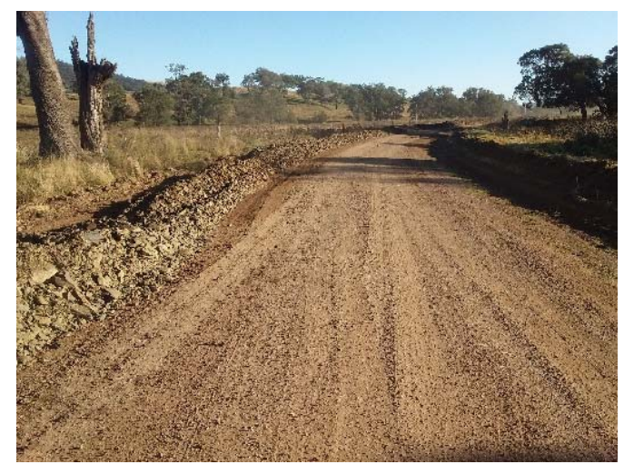
SR17 Back Creek Road, Gravel Resheeting

Work has commenced on a 2.5klm section of Back Creek Rd between the properties Glenidle and Llangoland. There are several other areas along the road which will be repaired while the resheeting crew is in the area.