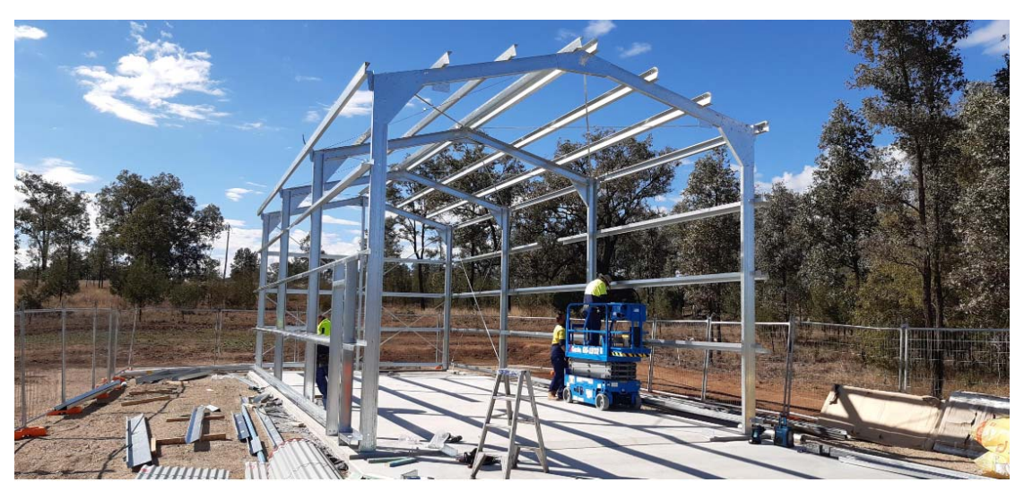
Construction of the Gineroi RFS Shed