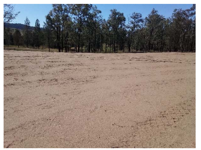
Sheepstation Creek Rd site