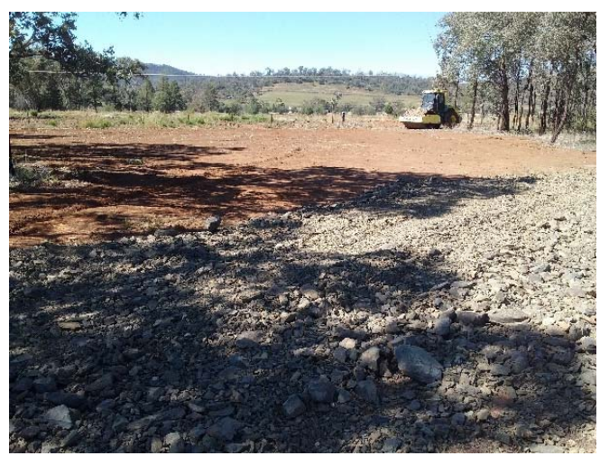
Delungra Road - Allan Cunningham Way Site

Work has commenced on two grant funded rest stops near Bingara, located at the intersection of Delungra Rd and Allan Cunningham Way and the intersection of Delungra Rd and Sheepstation Ck Road. Both rest stops will feature toilet facilities and covered picnic tables and form a part of the Big River Dreaming project.