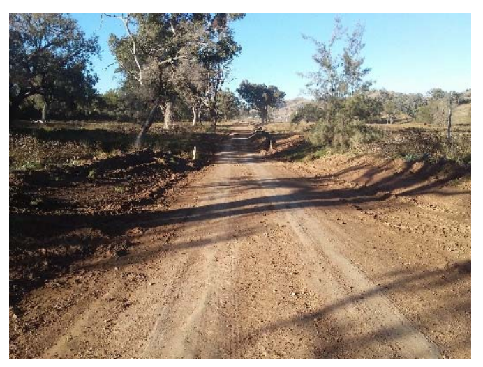
SR17 Back Creek Road, Gravel Resheeting