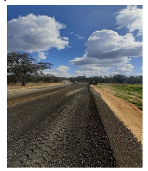
North Star Road – Flaggy, Subbase

Earthworks stabilisation has been completed and gravel has been carted for the subbase for the North Star Road Repair Project. This 1.7km project rehabilitates a section of North Star Road with inadequate width and significant pavement failure. Subgrade investigation revealed significant moisture and plasticity issues with the underlying basalt clay, which was addressed by blending with lime and sandstone.