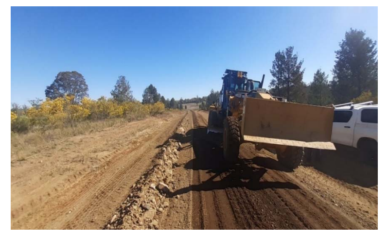
SR74 Kurrajong Hills Rd, Resheeting