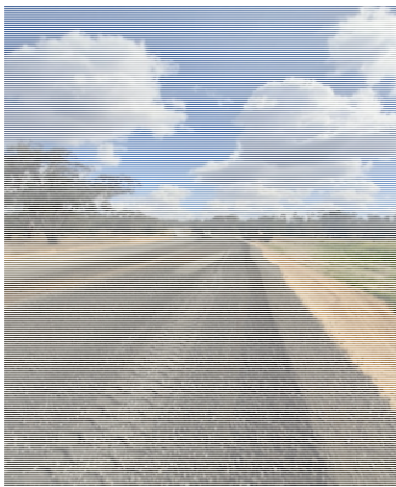
North Star Road – Flaggy, Subbase

Earthworks stabilisation has been completed and gravel has been carted for the subbase for the North Star Road Repair Project. This 1.7km project rehabilitates a section of North Star Road with inadequate width and significant pavement failure. Subgrade investigation revealed significant moisture and plasticity issues with the underlying basalt clay, which was addressed by blending with lime and sandstone.