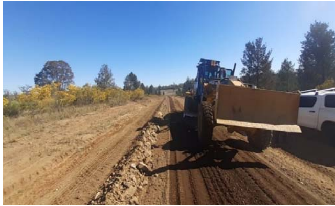
SR74 Kurrajong Hills Rd, Resheeting