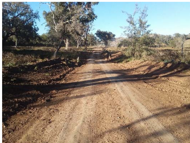
SR17 Back Creek Road, Gravel Resheeting