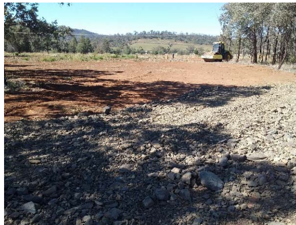
Delungra Road – Allan Cunningham Way Site

Work has commenced on two grant funded rest stops near Bingara, located at the intersection of Delungra Rd and Allan Cunningham Way and the intersection of Delungra Rd and Sheepstation Ck Road. Both rest stops will feature toilet facilities and covered picnic tables and form a part of the Big River Dreaming project.