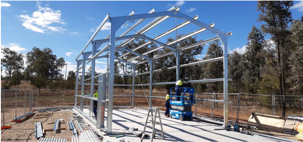
Construction of the Gineroi RFS Shed