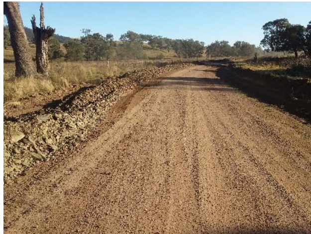
SR17 Back Creek Road, Gravel Resheeting

Work has commenced on a 2.5klm section of Back Creek Rd between the properties Glenidle and Llangoland. There are several other areas along the road which will be repaired while the resheeting crew is in the area.