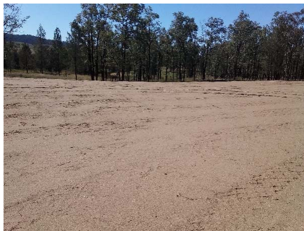
Sheepstation Creek Rd site

This is page number 6 of the minutes of the Public Infrastructure Committee held on Thursday 10 September 2020