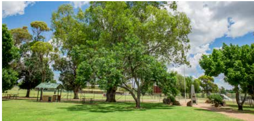
Photo bottom left Captain Cook Park