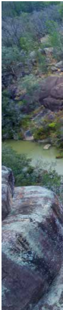
Cranky Rock lookout