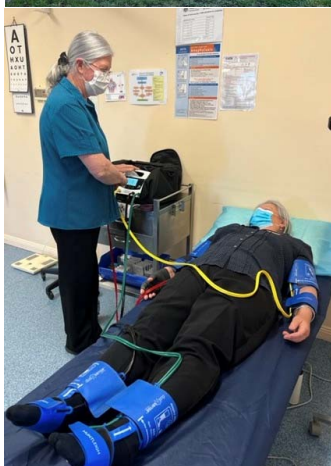
Ankle Brachial Index machine purchased for Bingara Doctors' surgery.