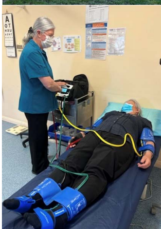
Ankle Brachial Index machine purchased for Bingara Doctors' surgery.