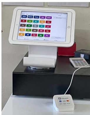
Left: Square cash register purchased to make efpos possible and keeping track of purchases easier. Below: small shed erected by volunteers for storage.