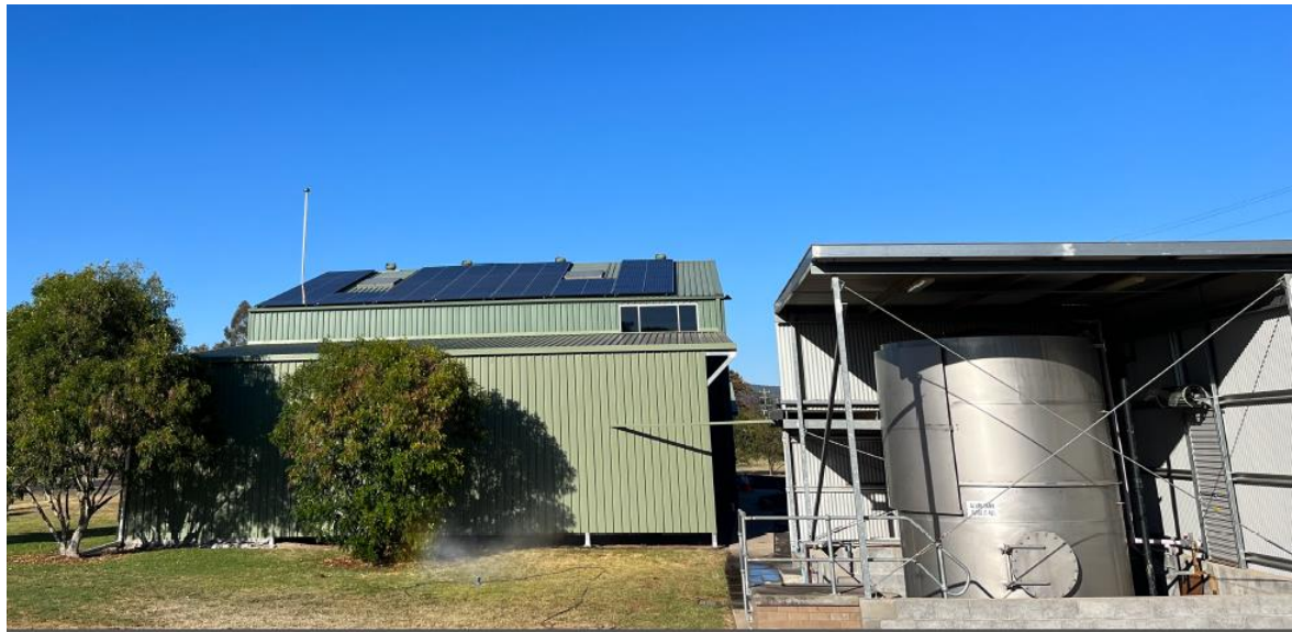
New solar panels on Bingara Water Treatment Plant