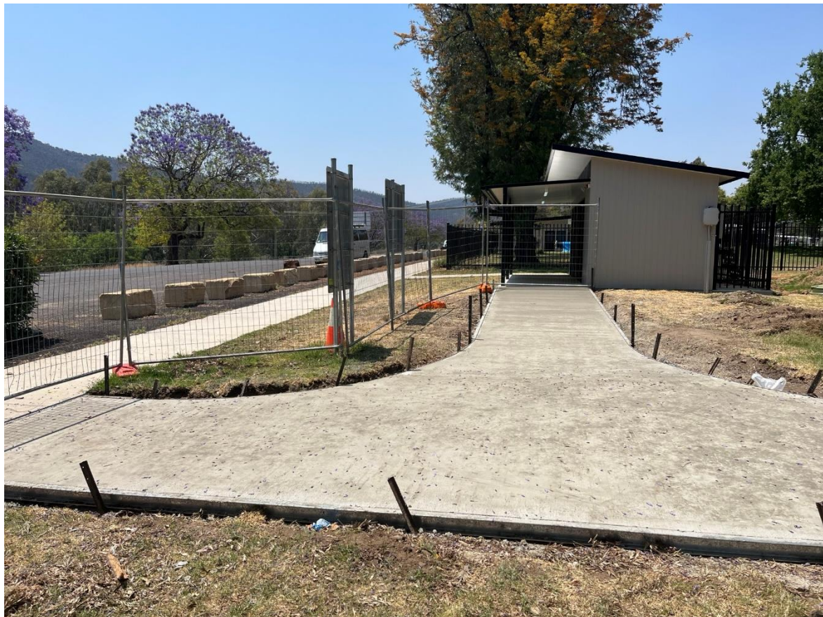
Cunningham Park Earthworks

Earthworks have commenced on the skate park in Cunningham Park incorporating footpath to BBQ area and toilet block. Shaping of the skate park continued during October with concreters due to arrive in January 2024 for completion in April 2024.