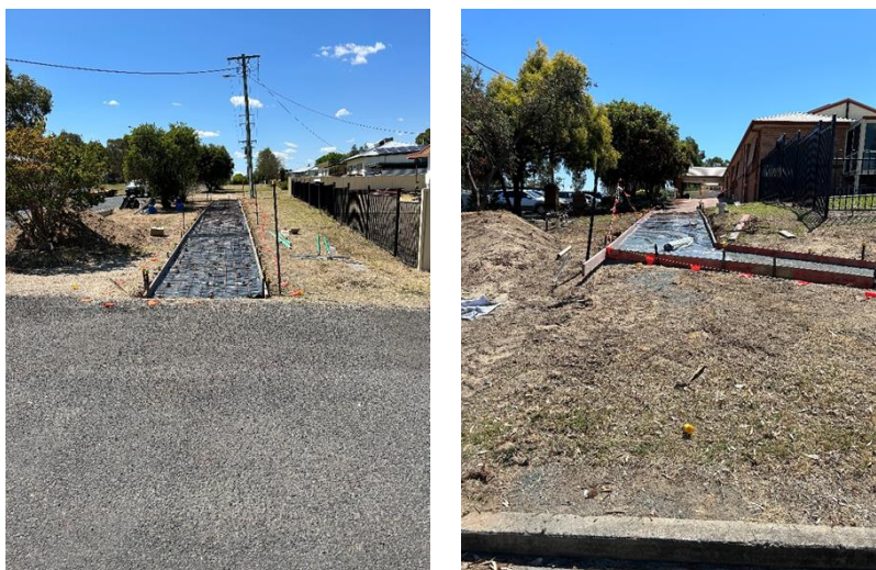
Naroo footpath under construction in Warialda