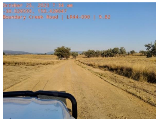
SR44 Boundary Creek Road

Council continues to value add to contracted flood damage restoration works wherever possible, by extending works using existing, Council funded maintenance budgets.