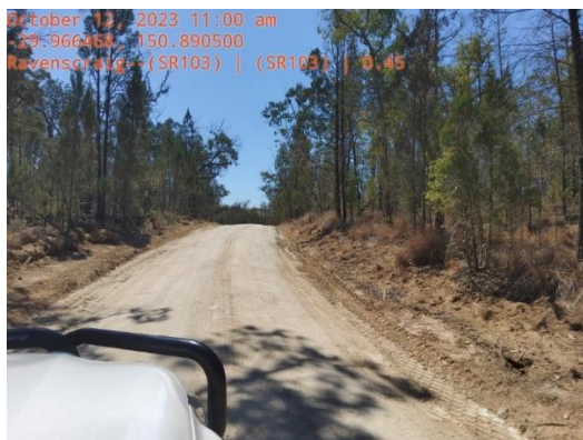
SR103 Ravenscraig Road