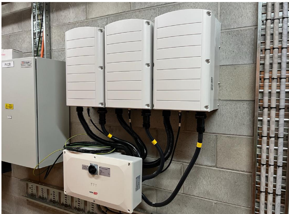
Solar system at Bingara Water Treatment Plant