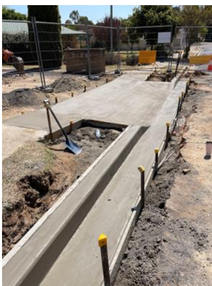
Plunkett Street, Warialda

Staff assisted RFS with fires on Pallal, Killarney Gap, Sheep Station Creek and Baroma Roads in October.