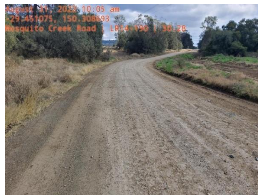
SR13 Mosquito Creek Road

Contractors ATJ's Earthworks have completed 2.7km of formation grading and 900m of damage repairs on SR103 Ravenscraig Road. They continue to work on SR44 Boundary Creek Road, resheeting a 2.6km section of damaged pavement.