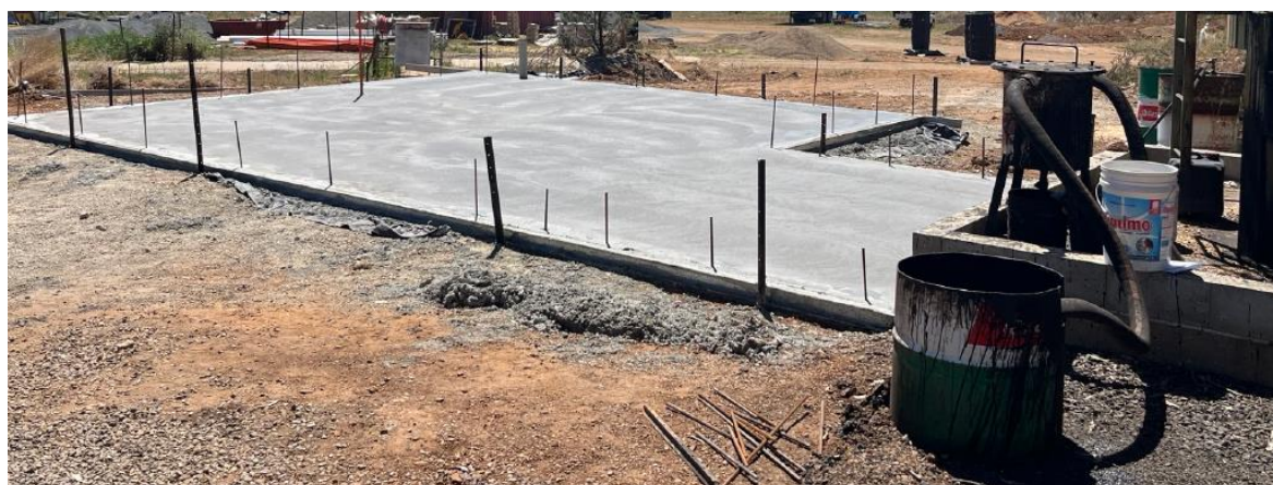
Slab for New Emulsion Tank at Bingara Sewerage Treatment Plant

A slab has been installed for a new emulsion tank at the Bingara sewerage treatment plant. The existing tank was not large enough to handle semi-trailer loads of emulsion. The slab will have 600mm concrete wall installed as bunting for tank overflows and spillage. The tank is provided under contract from Downer EDI which locks council into a competitive five-year contract for the supply of emulsion the at Bingara and Warialda depots.