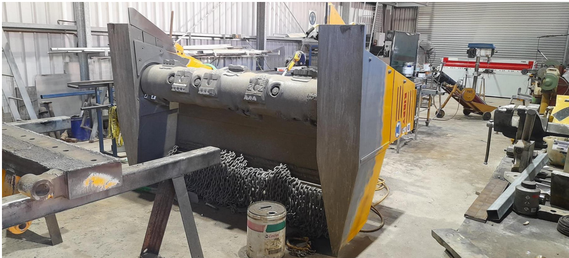
P1663 - Rebuilding Rock Crusher