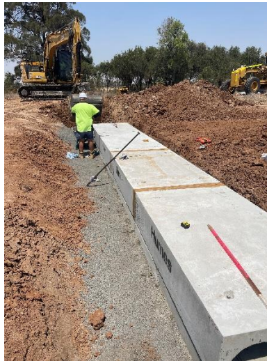
SR9 IB Bore Road

installed as low flow structures near a new causeway, where earthworks are underway.