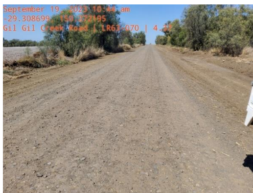
SR63 Gil Gil Creek Road

Throughout October, Flood damage crews completed work on a 2.7km section of road on SR18 Gineroi Road, 900m on SR286 Sonoma Road and are currently working on SR267 Cumble Road repairing 80m of damage and formation grading and drainage over the 5km. A second crew have completed formation grading and drainage works on SR63 Gil Gil Creek Road and are currently working on table drain maintenance on SR14 Mosquito Creek Road and formation grading of its unsealed section.